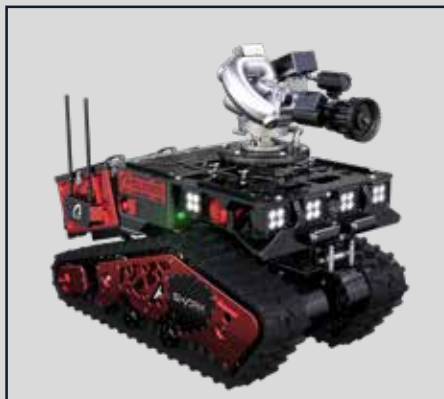
WATER / FOAM MONITOR