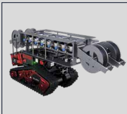
BREATHING AIR SYSTEM