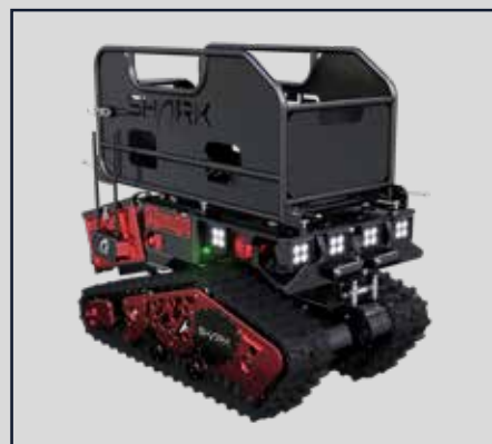
EQUIPMENT TRANSPORTATION BASKET