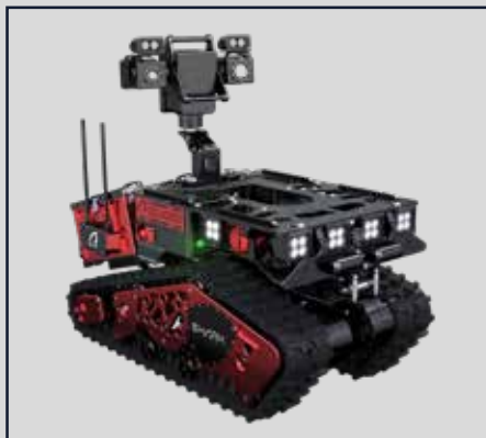
VIDEO TURRET 180°