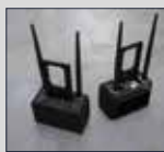
▶ MESH RELAY FOR LONG DISTANCE TRANSMISSIONS