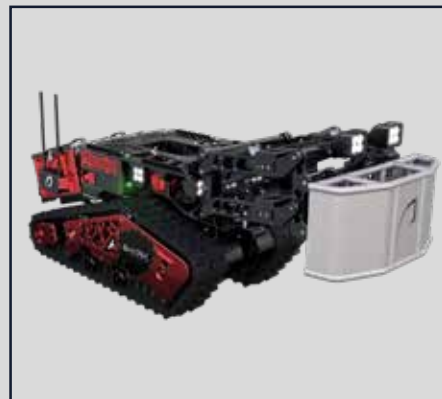
MOTORISED BULL BAR