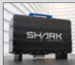
▶ EXTRA BATTERIES