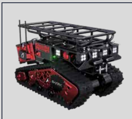
STRETCHER FOR WOUNDED PEOPLE