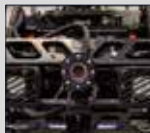
▶ FRONT | BACK CONTROL CAMERAS