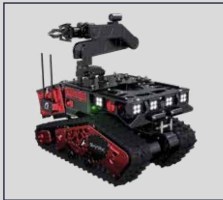
ARM (LIFT CAPACITY: 70 KG / 154 LBS)