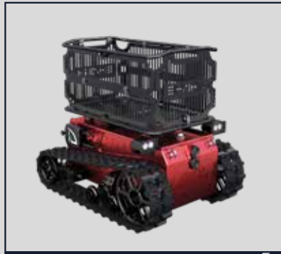
EQUIPMENT TRANSPORTATION BASKET