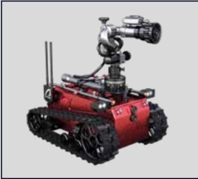
WATER / FOAM MONITOR