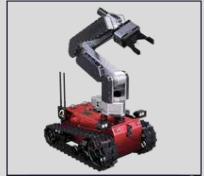
ARM (LIFT CAPACITY: 70KG - 154 LBS)