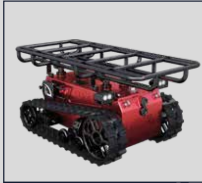
STRETCHER FOR WOUNDED PEOPLE