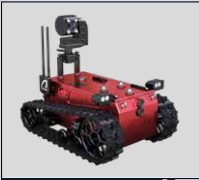
VIDEO TURRET 360°